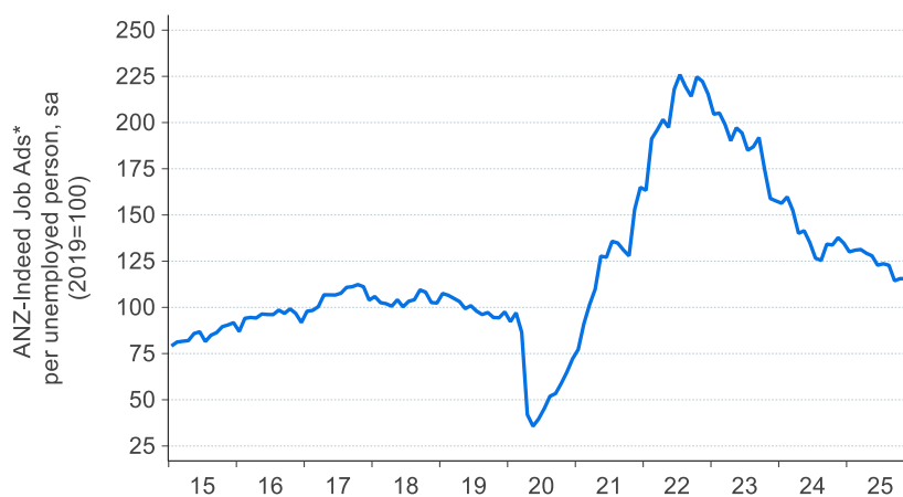
Figure 3. ANZ-Indeed Australian Job Ads per unemployed person (index)

*Last observation uses previous month's unemployment as a proxy. Source: ANZ-Indeed Australian Job Ads, ABS, Macrobond