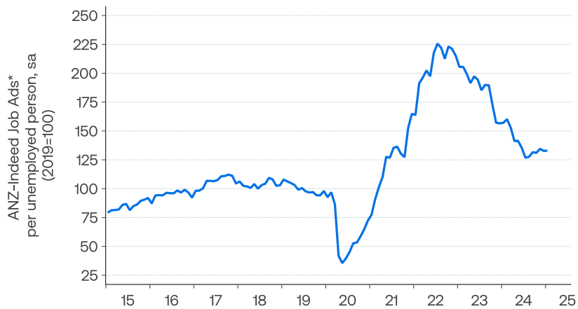
Figure 3. ANZ-Indeed Australian Job Ads per unemployed person (index)

*Last observation uses previous month's unemployment as a proxy.