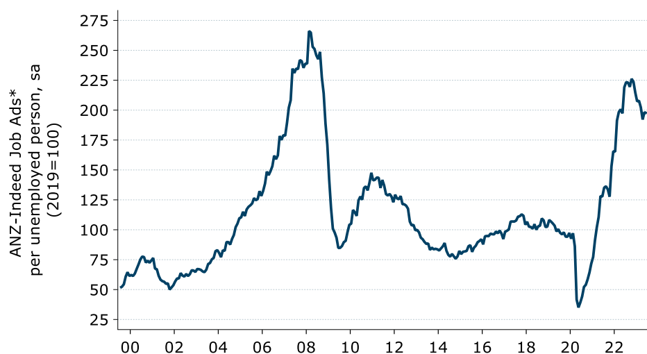
Figure 3. ANZ-Indeed Job Ads per unemployed person (index)

*Last observation uses previous month's unemployment as a proxy.