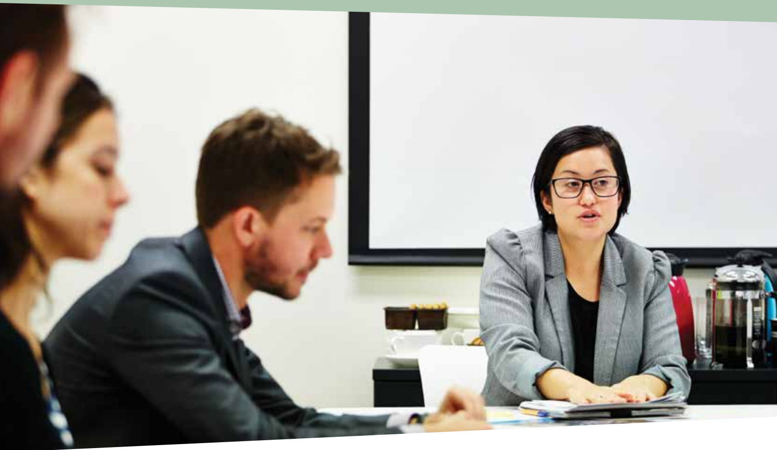
Saver Plus management meeting at Brotherhood of St Laurence.