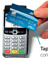
Tap contactless card or Smartphone