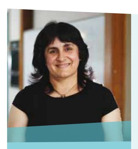
Dalal MoneyMinded participant