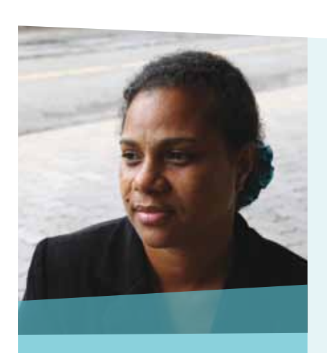
Dorcas MoneyMinded participant