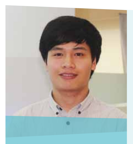
Quy MoneyMinded participant