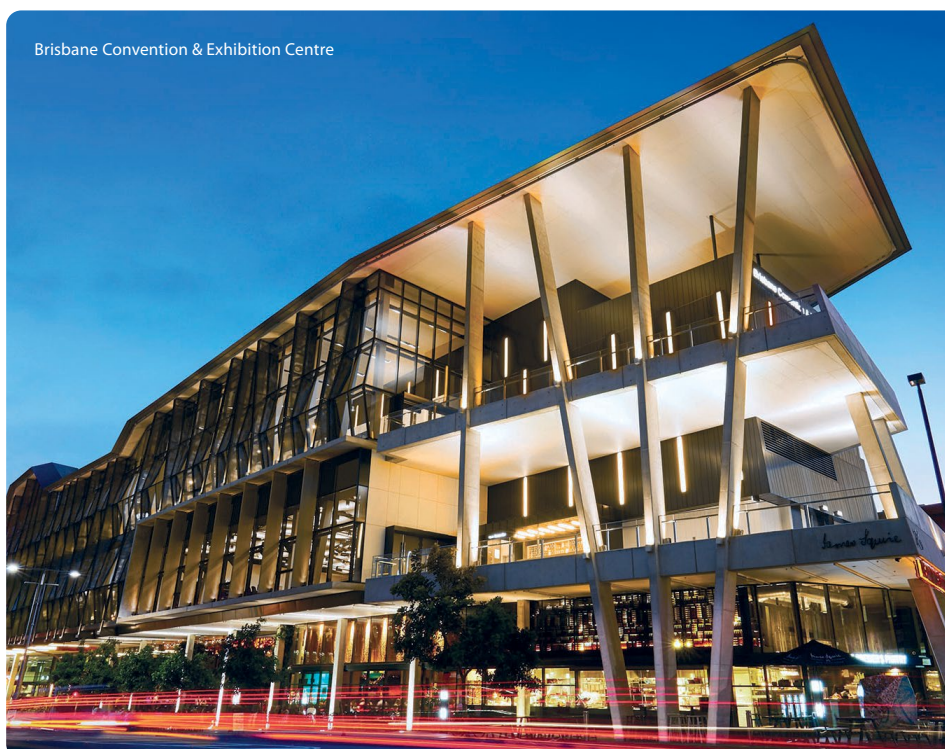
Brisbane Convention & Exhibition Centre